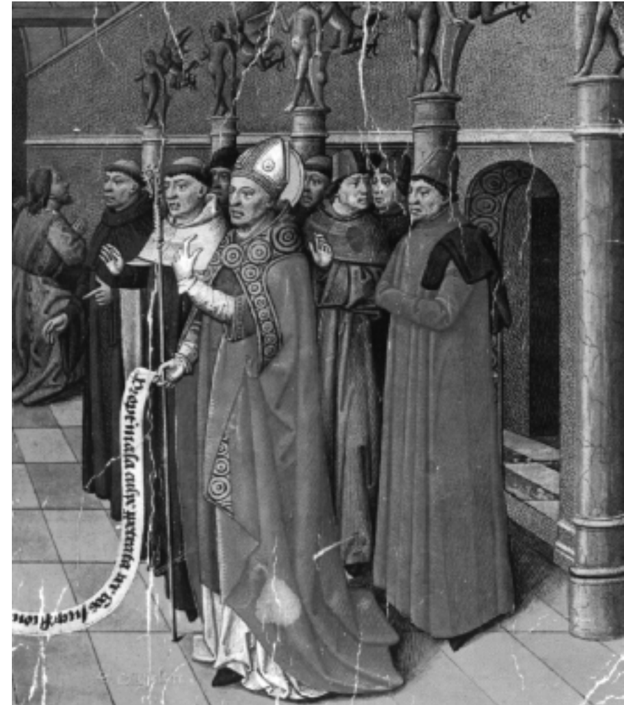
Detail from a French illuminated manuscript in the Bibliothèque Nationale, Paris, depicting Saint Augustine.

One law of politics is that a person in whatever capacity be prepared to serve on a basis of equality, and in a spirit of mutual respect and collaboration with citizens holding views which may differ from his own on moral and religious matters. A Christian