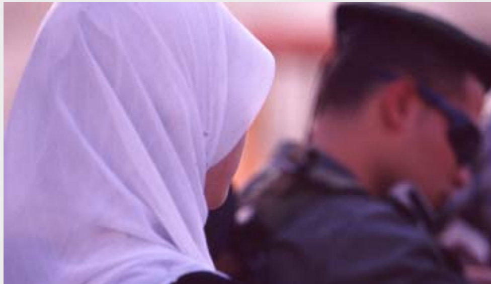
IMAGES FROM PALESTINE In Jerusalem, a Palestinian university student is stopped and checked on her way to school by an Israeli soldier.