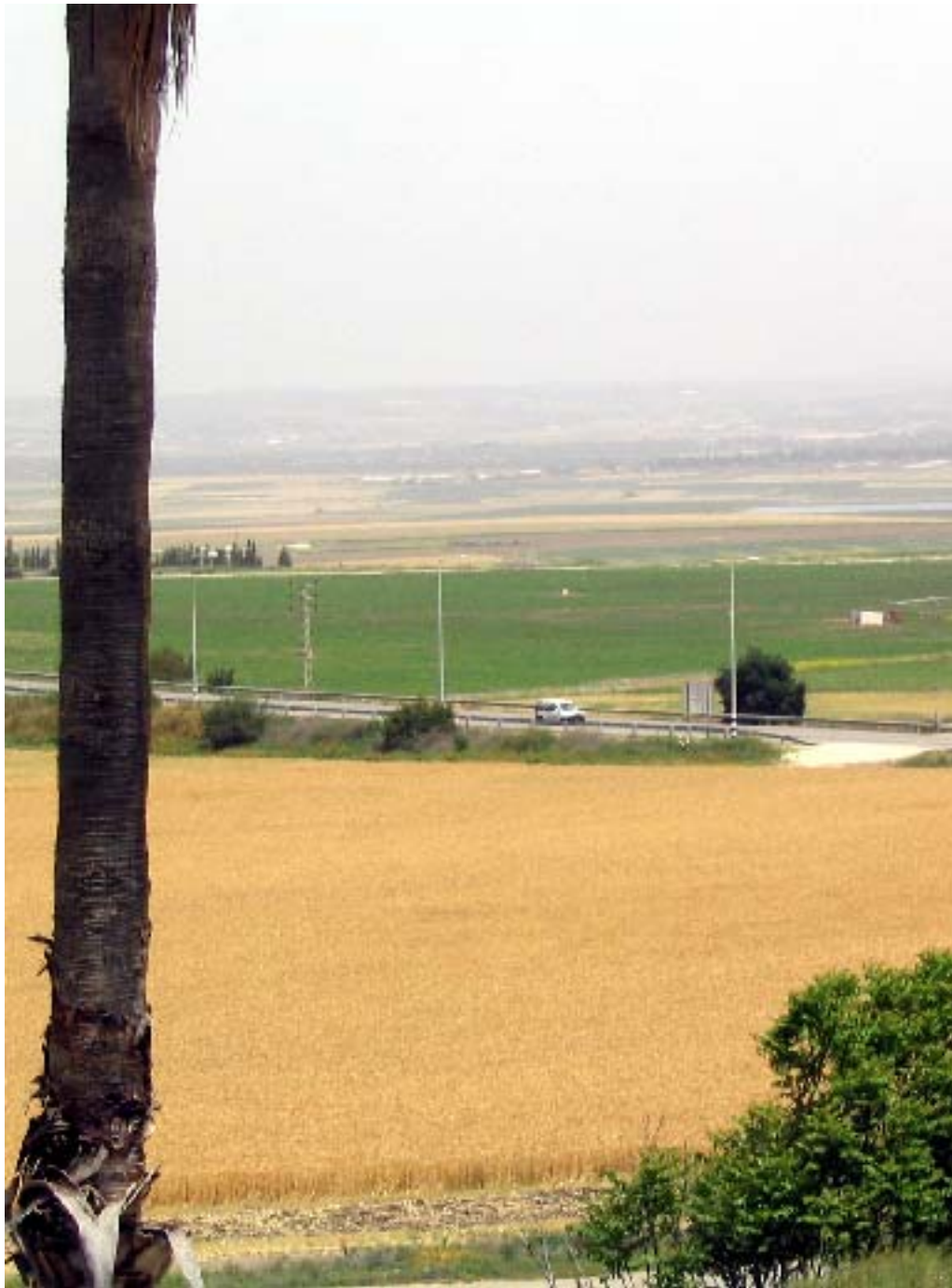
The Jezreel Valley, as seen from Tel Megiddo – known as Har Megiddo in the Hebrew Bible and Armageddon in the New Testament.

Before we officially tilt toward Israel, Canadians need to think harder about the Mid-